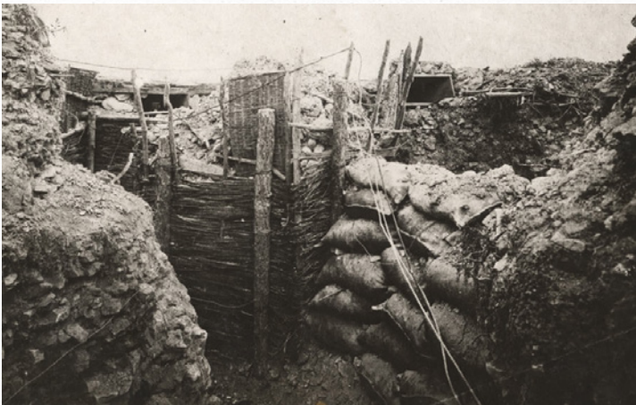
Interior of a trench with hurdles and barriers, The National WWI Museum and Memorial