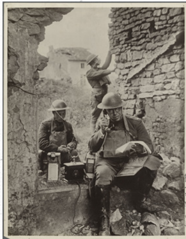
Soldiers manning a portable trench phone, 1917-18