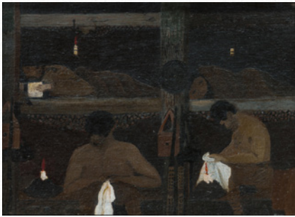
Study for "Barracks," 1945, by Horace Pippin, Philadelphia Museum of Art DOWNLOAD