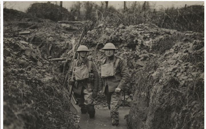
British soldiers standing in water in a trench DOWNLOAD