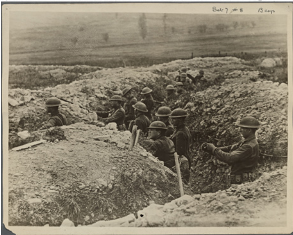
Troops in a trench, 1917-18 DOWNLOAD

Life in the Trenches of the First World War , Imperial War Museum