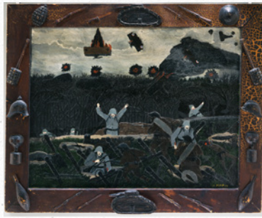
Dogfight Over the Trenches, 1935, by Horace Pippin, Hirshhorn Museum and Sculpture Garden, Smithsonian Institution DOWNLOAD