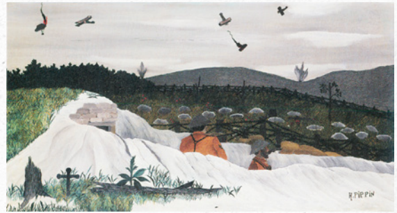
The Ending of the War, Starting Home, 1930-33, by Horace Pippin, Philadelphia Museum of Art DOWNLOAD

As shown in The Great War , Horace Pippin sustained a near-fatal injury in September 1918 during the Meuse-Argonne Offensive. A bullet shattered his right shoulder and caused him to lose full use of his dominant right arm. When Pippin returned to the U.S., he faced not only the racism and employment and housing discrimination widely encountered by returning African American veterans, but an additional burden: widespread bias against people living with disabilities. During his time as a soldier, Pippin wrote a journal of his wartime experience , which included hand-drawn illustrations of scenes from the war. After returning home, he again turned to art, this time as part of his physical therapy. He began selling painted cigar boxes to make extra money and also experimented with burning images into wood panels before turning to oil painting. His first solo art exhibition was in 1937, and within a year several of his paintings were included in a Museum of Modern Art exhibition. Despite having no formal art training, Pippin became a widely exhibited folk artist, whose work was sought after by museums and collectors. His subject matter varied, but a number of his paintings depict scenes from World War I.